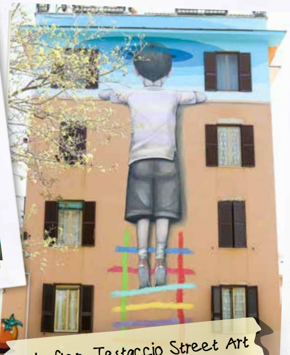
And after, Testaccio Street Art