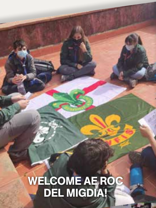
WELCOME AE ROC DEL MIGDIA!