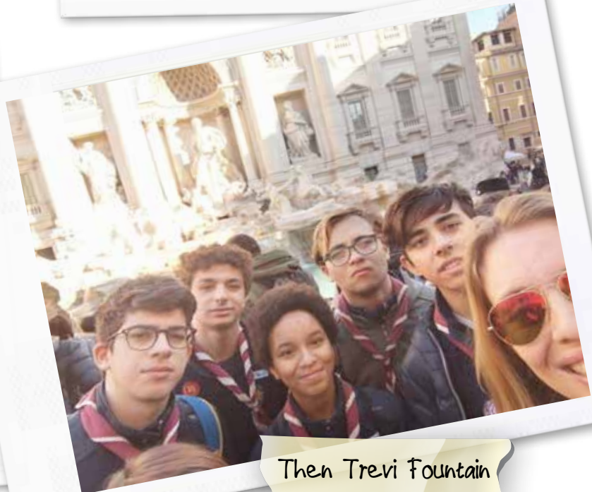
Then Trevi Fountain