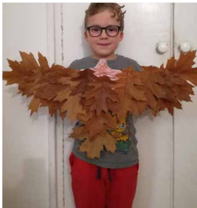
Totem of Eagle patrol from leaves

SKAUT – CESKY SKAUTING ABS http://abs2013.skautabs.cz/