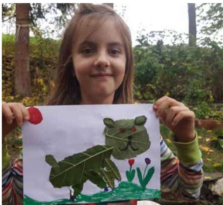
Beaver from autumn leaves

Meetings were moved to "google meets" and regular scout activities continued. Thanks to internet maps, we were able to "go" on an expedition to a castle or chateau or "walk" around the city. We played games together and we learned new