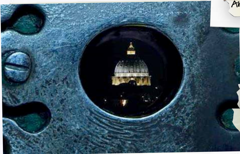
Till to get a look to S. Peter by night, from the keyhole of the Orange Gardens