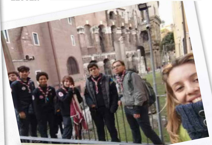
The Roman Ghetto and The Theatre of Marcellus