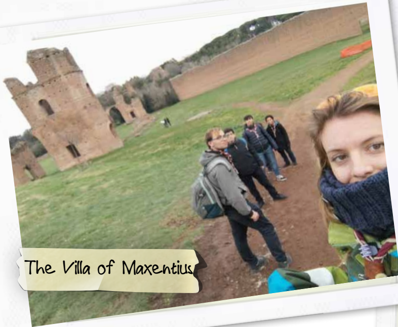
The Villa of Maxentius