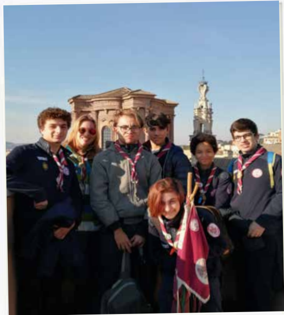
Of course, starting from the town centre and Venice Palace